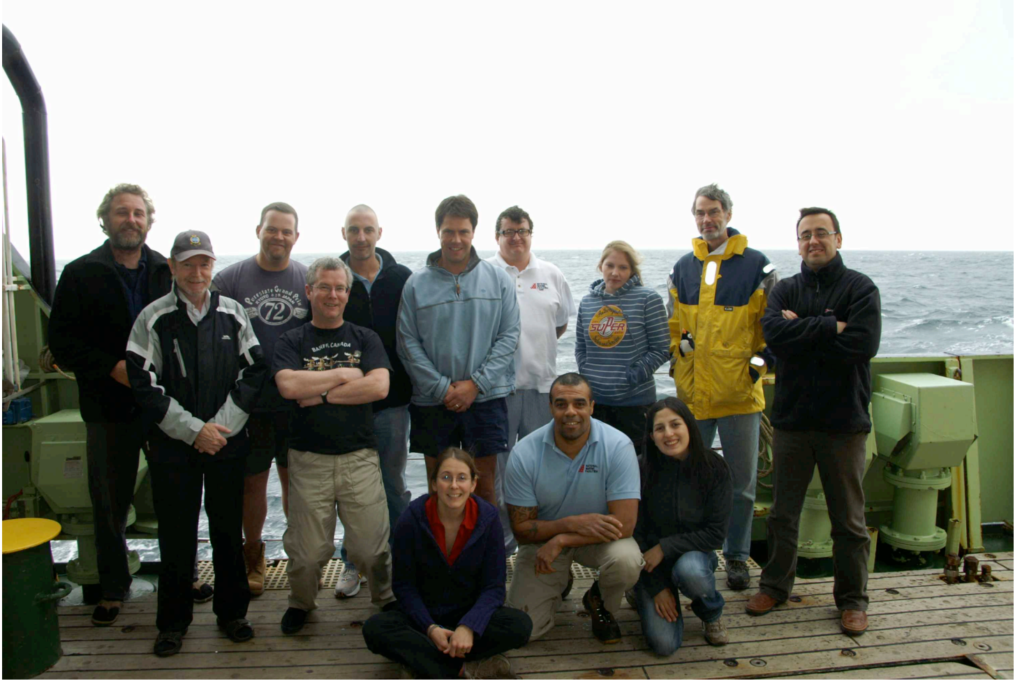
Scientists, technicians and some of the crew of the UK-1 DIMES cruise posing.